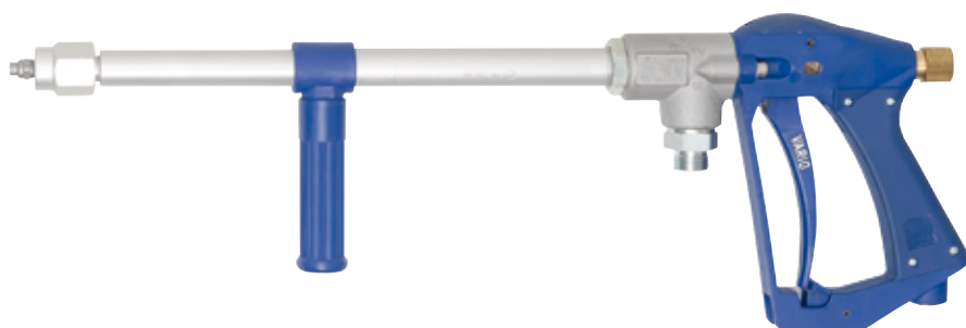
Spray gun SP 250-Vario with adjustable flow rate